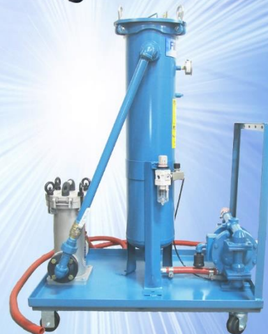
Model FC-MS2-ND-25-M1.511 (With Inline cleanable Magnet Prefilter)