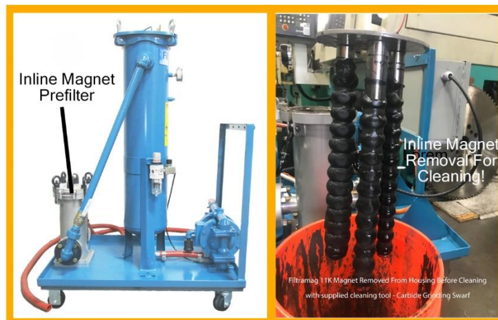
Table 4: Inline Magnet Adder

FCMS2 - TABLE 1 - TABLE 2 - TABLE 3 - TABLE 4 DUTY FLOW FILTER ADDER