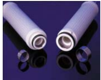
Stainless Steel Inserts

Efficiency, flow capability and service life are similar for all available constructions.