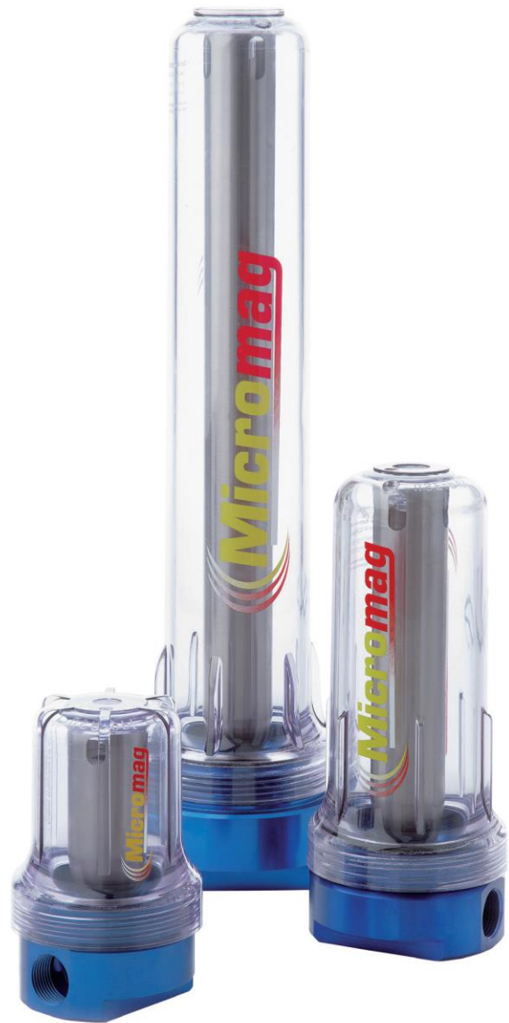
Magnetic circuit & fluid flow path.