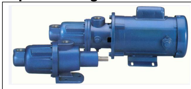
PSK MODEL PUMP

THE PUMP MUST BE PRIMED BEFORE INITIAL START-UP, AND CANNOT BE RUN DRY.