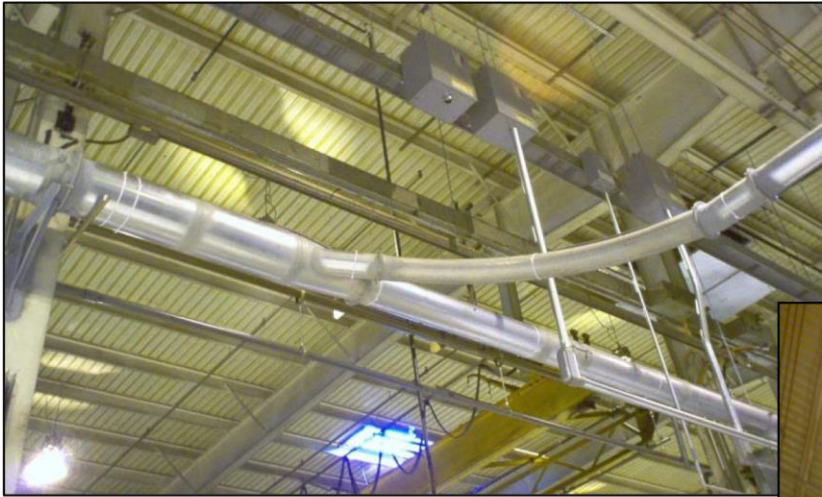
Overhead Pneumatic Piping