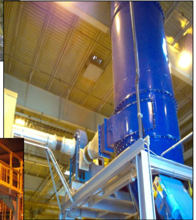
Chip/Coolant Collector with Inlet Blower