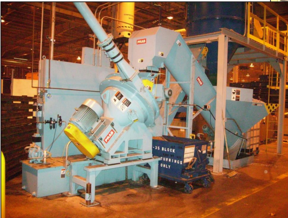
Chip/Coolant Collector feeds directly to PRAB Chip Processing System