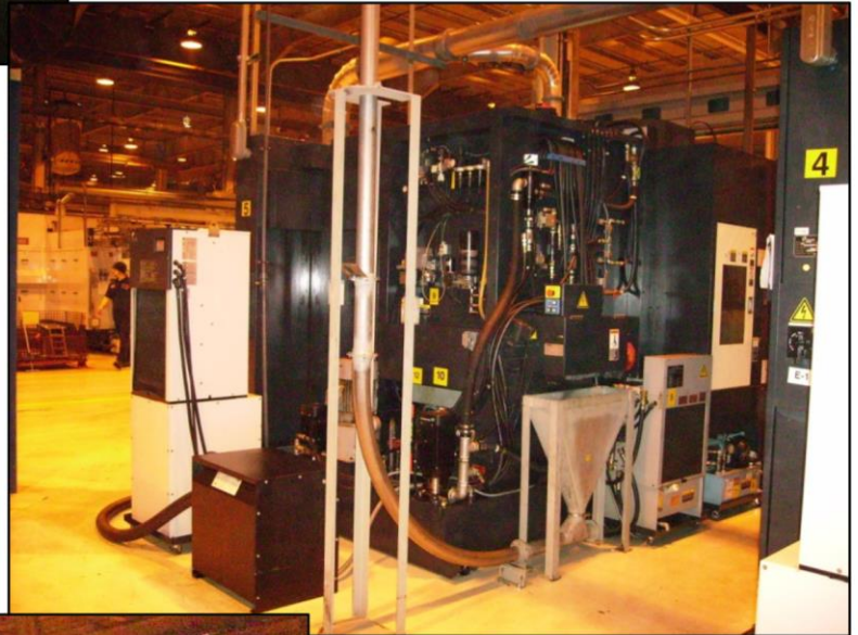
View of Receiver Hopper and Pneumatic Piping