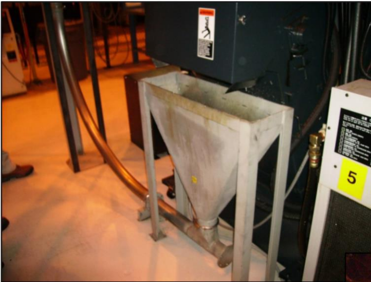
Typical Chips and Coolant Inlet Receiver Hopper from CNC Machine

PRAB offers a variety of efficient pneumatic chip conveyors that are designed to transport both wet or dry metal chips to or from processing. PRAB offers both positive pressure and vacuum conveyor models depending on application. The photos on these pages show a negative pressure (vacuum) system with multiple inlets feeding a chip processing system.