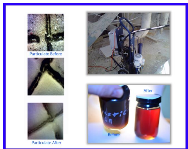
Figure 2: Paper Plant Caustizer Gearbox

A PHoenix™ 1 GPM cart was installed on the 300-gallon oil reservoir with 220 weight synthetic oil. After the first oil sample was pulled it was found water levels were as high as 3000 ppm and iso cleanliness counts were 21/20/19. After the PHoenix™ completed the task after one-month water level had dropped to below 300 ppm and iso counts to 17/15/13. Results can be seen in figure 2.