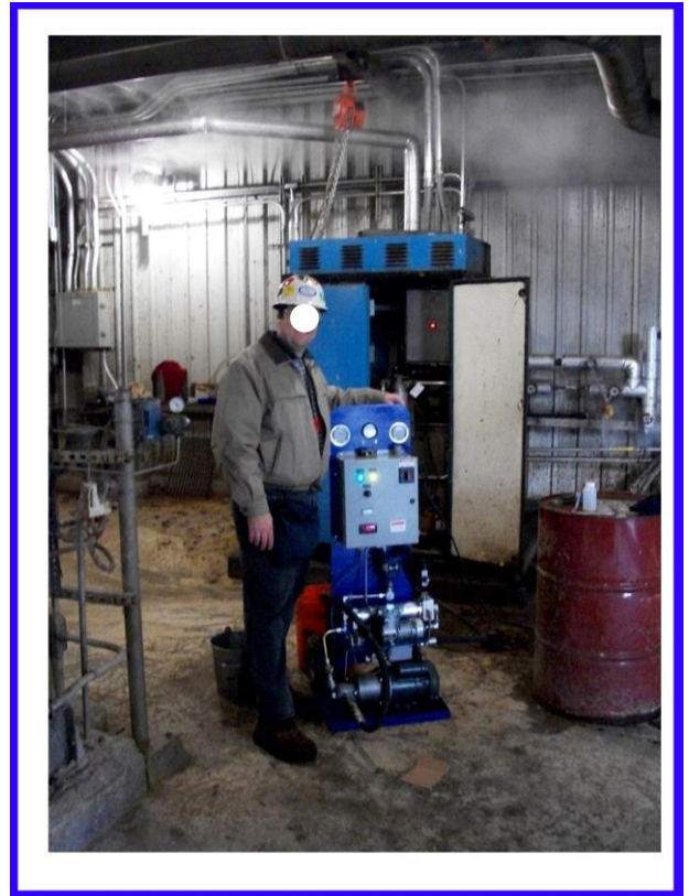
Figure 1: Paper Plant Knotter Hydraulics

Results can be seen in the graph in figure 2 below .