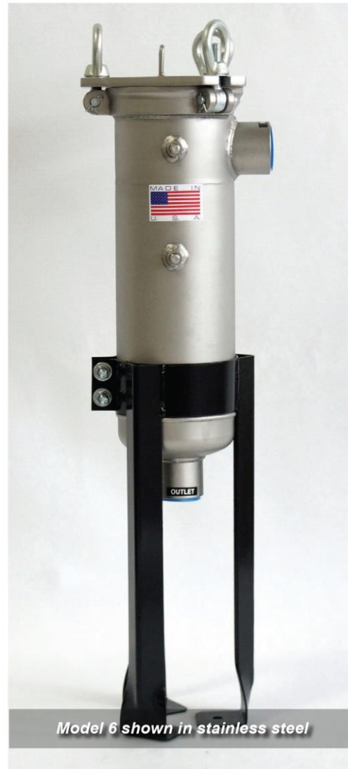
Model 6 shown in stainless steel