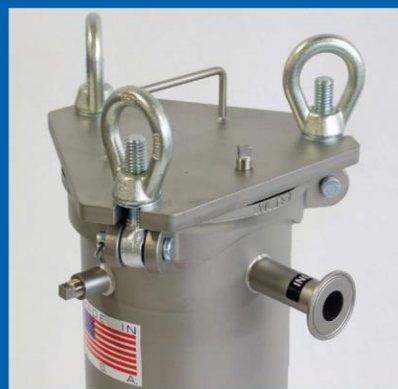
Model 6 stainless steel with sanitary connections

NOTE: *Based on housing only. Fluid viscosity, bag filter used, and expected dirt loading, should be considered when sizing a filter.