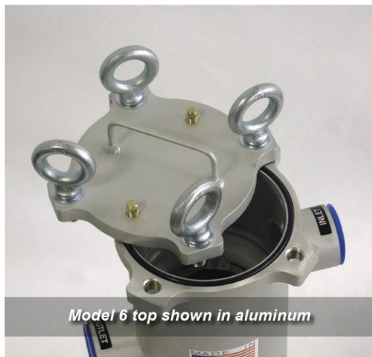
Model 6 top shown in aluminum