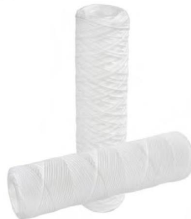
DW Series-61 wound filter cartridges are available in a variety of sizes and configurations

NSF/ANSI 61 was developed to establish minimum requirements for the control of potential adverse human health effects from products that contact drinking water. Evaluation included laboratory extraction testing for assessment of non-contribution of a variety of VOCs and a variety of metals such as lead and an on-site audit of our quality system.