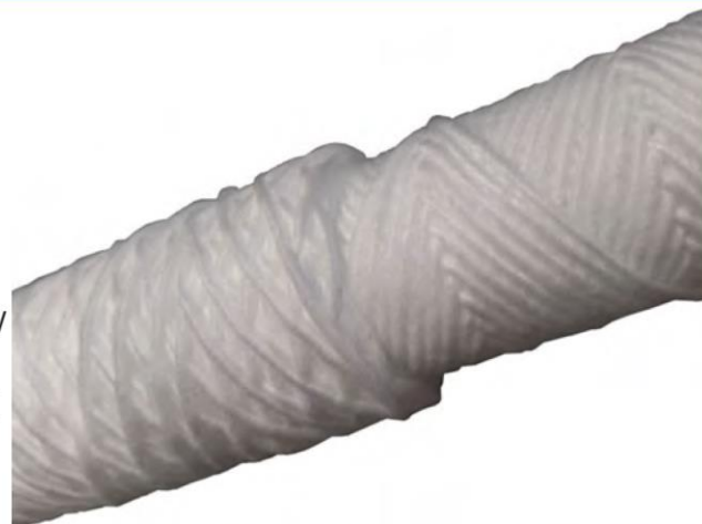
HC Series-61 string wound filter cartridges provide longer life by virtue of their dual-zone construction

HC Series-61 polypropylene string wound filter cartridges are certified to comply with materials safety requirements of NSF/ANSI 61 "Drinking water system components - Health effects." These filters are manufactured to be used by water municipalities and in various point-of-entry (POE) potable water systems. In addition, these filters are made using polypropylene complying with FDA CFR 177.1520. HC "high capacity" string wound filters, formerly sold under the Delta Pure name, provide excellent filtration for fluids with a wide particle size distribution. The HC series filters are wound with two zones in order to provide longer filter life with challenging fluids. A more open pre-filtration section serves to protect the downstream media and remove larger particles, while a tighter final filter section provides removal of smaller particles. The rating of each zone is specified in order to provide a filter uniquely tailored to process requirements. Precision winding geometry provides consistent removal efficiency. Ratings are available from 0.5um to 200um. Polyester or polypropylene core covers allow added containment removal assurance. Cartridges are available in continuous lengths from 3" to 72" and diameters from 2" to 4 1/2". End fitting options allow installation into most filter housings.