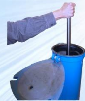
Optional MagFil Cleanable Bag Filter Drop in Magnet