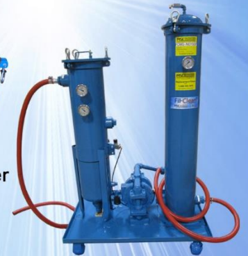
Compressed Air Version